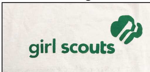
5 - Girl Scouts Logo Small