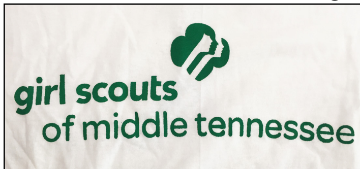
8 - Girl Scouts of Middle Tennessee Logo