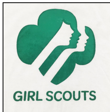
7 - Girl Scout Profiles