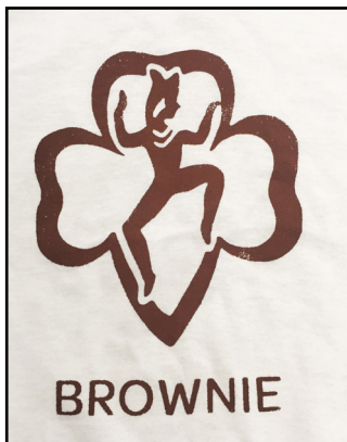
2 - Brownie Logo