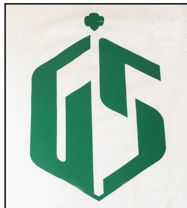
4 - Modern GS