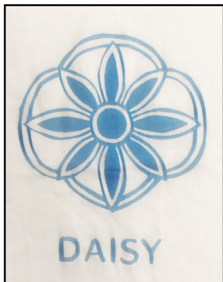
1 - Daisy Logo