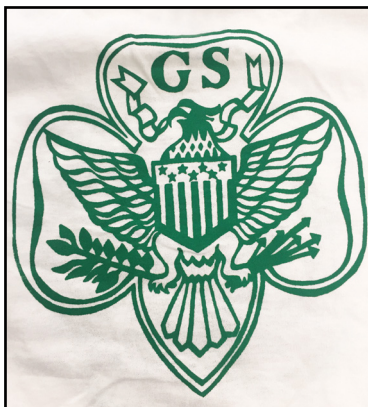
3 - Girl Scouts Icon