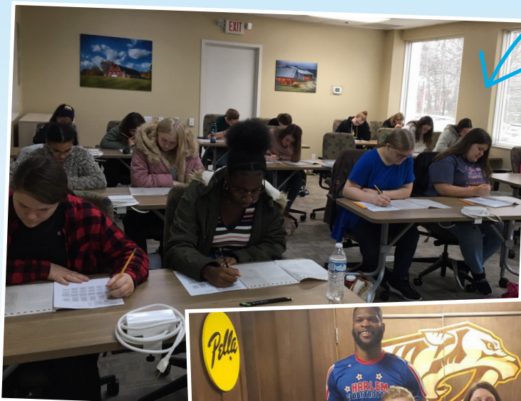
Girls took a practice ACT test at the Nashville Service Center.