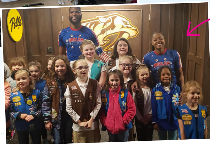
Girls had a blast meeting the stars at Girl Scouts and Globetrotters .