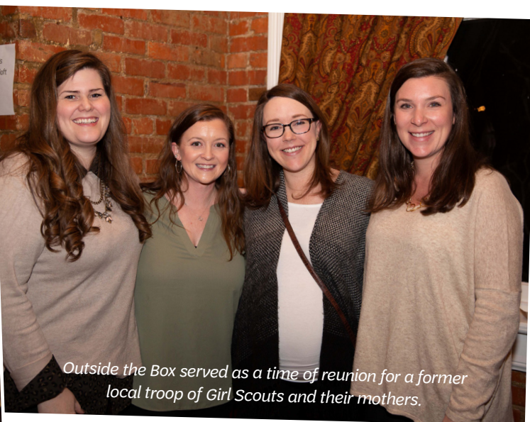
Outside the Box served as a time of reunion for a former local troop of Girl Scouts and their mothers.