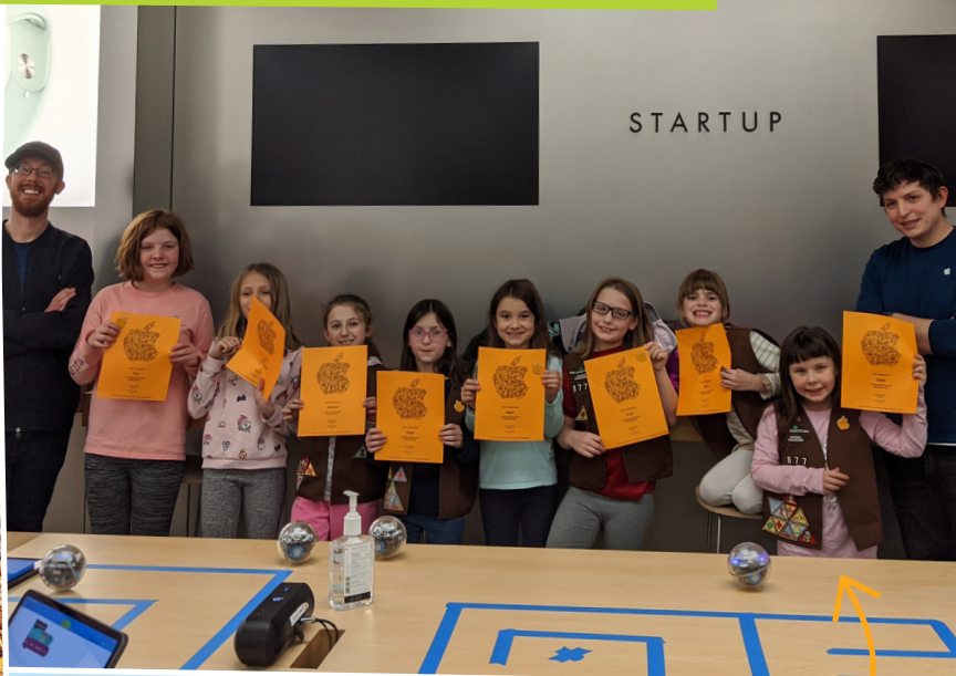
Brownies from Troop 877 learned about coding robots at the Apple store.