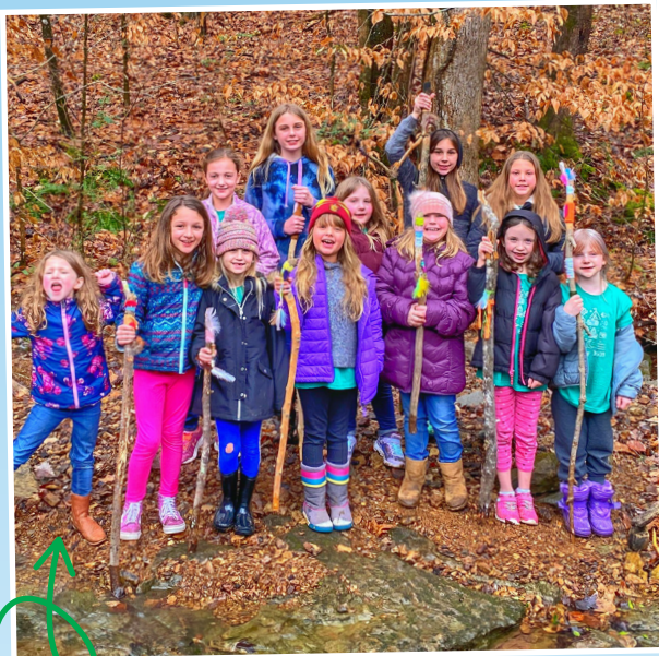
Brownies from Troop 1603 had a cabin campout at Camp Sycamore Hills!