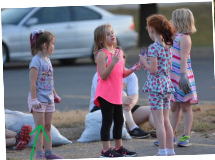
Troop 2836 enjoyed cleaning up the parking lot at their elementary school.