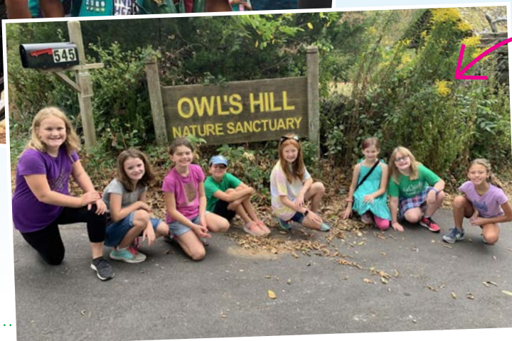
Troop 2706 had a blast at Owl's Hill Nature Sanctuary learning about the habitats and behaviors of owls.