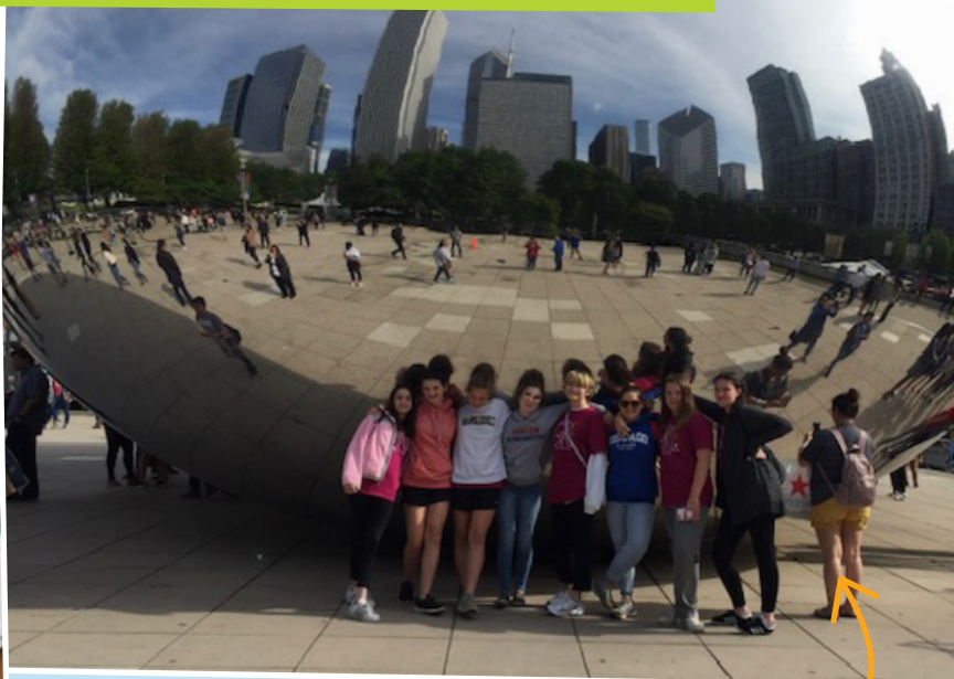
Thanks to fall product and cookie sales, Troop 449 was able to explore Chicago.