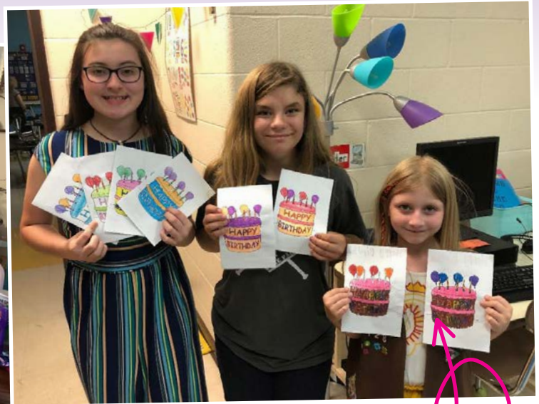
Girls in Troops 2432 and 2728 made cards for patients going through dialysis.