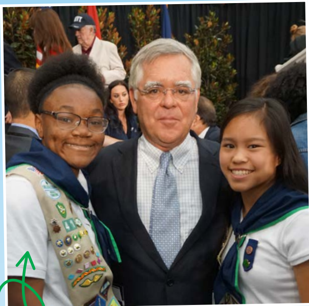
Girls from Troop 41 attended the inauguration of Nashville's Mayor John Cooper!